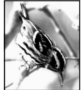
Black & White Warbler.

What is the reason for all this activity? A bountiful crop of berries on the Virginia Creeper vines that have wound their way to the very tops of the trees. If you have yanked out your Virginia Creeper vines to give your yard and trees a more manicured look, reconsider letting these native plants re-establish themselves, for you will never see the colorful berry-loving birds eating dried seed on your bird feeder.