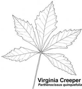
Virginia Creeper Parthenocissus quinquefolia

Habitat and range – Full light to partial shade, Virginia Creeper will grow anywhere and is native from New England to South Florida. The vine can easily grow to 50 feet or more and should be treated as invasive and kept under control.