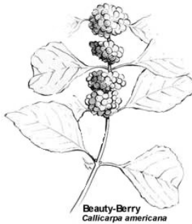
Beauty-Berry Callicarpa americana

Habitat and range – Pine woods and open hammocks in the southeastern U.S., throughout Florida. Drought-tolerant and grows readily in shady areas.